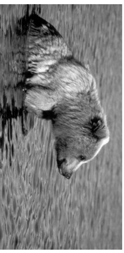
Figure 2.1: A majestic bear