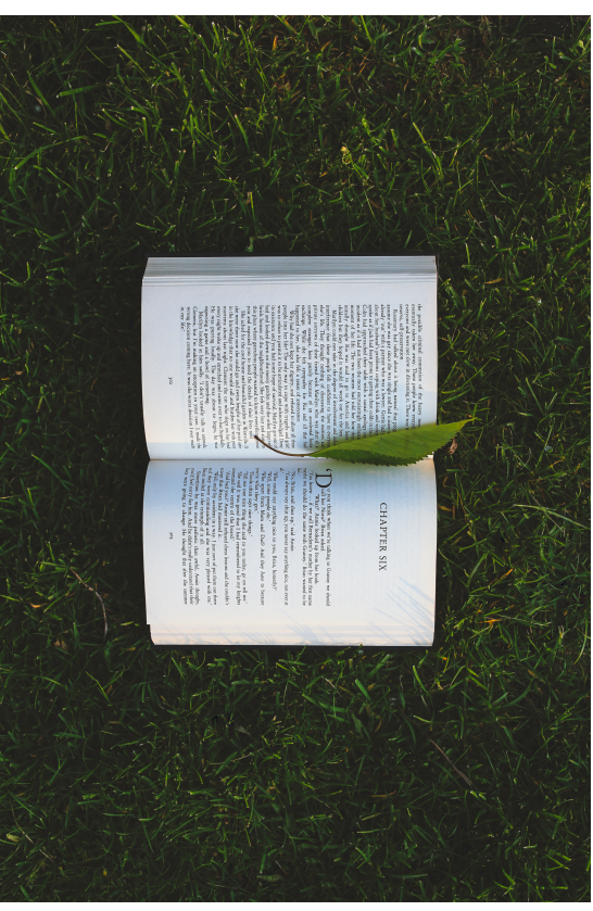
Figure 4.1: Photo by Kaboompics.com from Pexels

! [chapter-six] (book-chapter-six-5834.jpg "Photo by Kaboompics.com ↳ from Pexels")