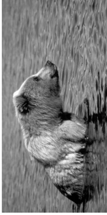
Figure 2.1: A majestic bear